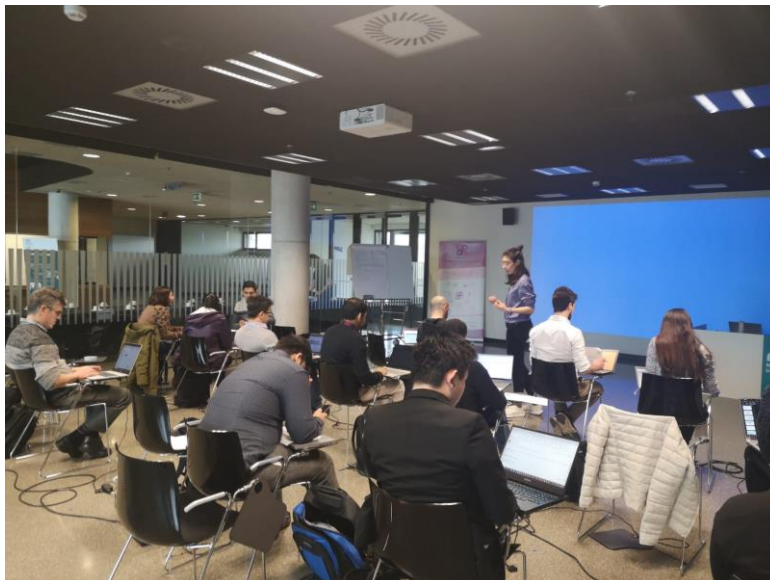
Figure 4: ESRs attending the practical lesson with Maite Couto

Session about “Valorisation and exploitation of research results” given by Maite Couto from MGEP. This session was a theoretical and practical session to understand how to valorise and exploit the research results.