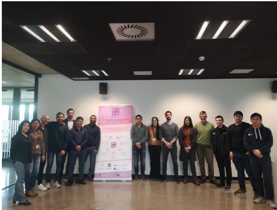
Figure 2: Welcome session given in Orona