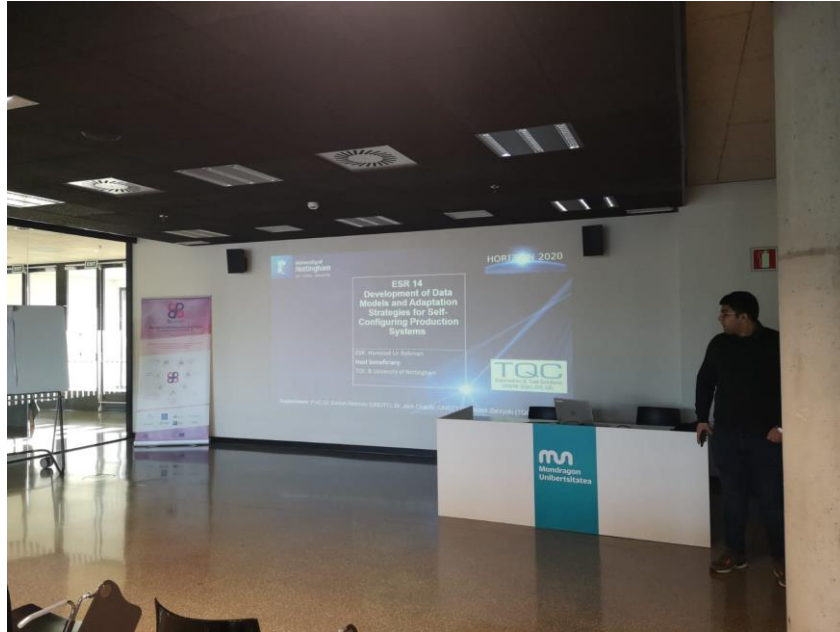
Figure 5: A picture of the session about “ESRs research projects presentation”